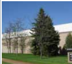
2000 CENTRAL AVE.