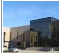
5500 CENTRAL AVE.