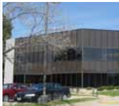
5766 CENTRAL AVE.