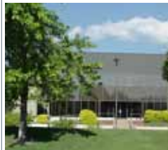
2585 CENTRAL AVE.