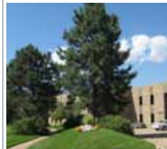
1898 S. FLATIRON CT