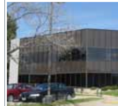
5766 CENTRAL AVE.

NEWMARK KNIGHT FRANK FREDERICK ROSS DRAFT 1/31/12 © 2012, MARKETING DEPT.